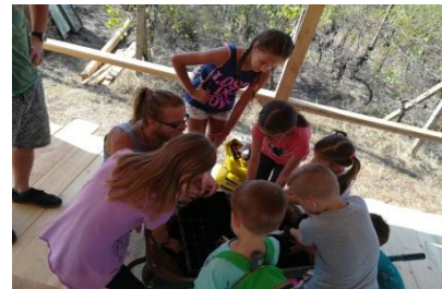
One of this years' Youth Initiatives

Along with our project partners, LDA Mostar participated in several regional project events and activities in 2018: 5 th Regional Network Meeting in Podgorica (Montenegro), 4 th Regional Youth Forum in Skopje (North Macedonia) and 6 th Regional Network Meeting in Novi Sad (Serbia).