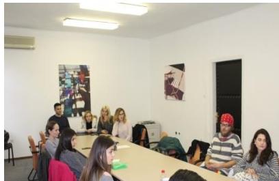
Final LYAG Meeting

In the fourth and final year of the project, LDA Mostar initiated and implemented several local mechanisms for youth participation such as Local Youth Advisory Group (LYAG), Youth Taking Over Day (YTOD), Youth Megaphone - International Youth Day Celebration, Local Youth Initiatives and local research which included interviews with local stakeholders. As a part of the research LDA Mostar produced a video interview which could be found on the following link .