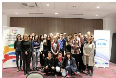
5 th Regional Network Meeting in Podgorica

Along with our project partners, LDA Mostar participated in several regional project events and activities in 2018: 5 th Regional Network Meeting in Podgorica (Montenegro), 4 th Regional Youth Forum in Skopje (North Macedonia) and 6 th Regional Network Meeting in Novi Sad (Serbia).