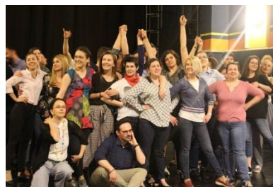
4 th Regional Youth Forum in Skopje