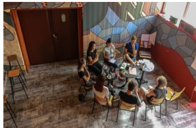
Youth Megaphone – International Youth Day Celebration