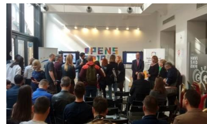
6 th Regional Network Meeting in Novi Sad